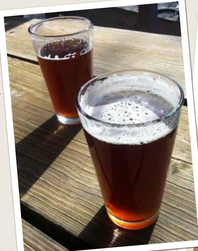
Oh, you know, just a little after-party to reward project-intense Factory Week.

Not a day goes by that we don't make each other LAUGH and we think that's one of the best things about working together. That, and BEER FRIDAYS .