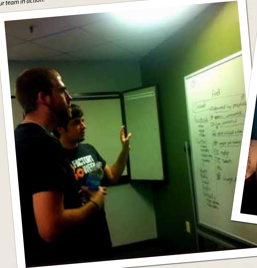
Our team in action.

We use the web to GROW BUSINESSES AND ORGANIZATIONS . The special sauce is how we get our results. This starts with really getting to know our clients. This means understanding their fundamentals — what they are selling or providing, who their audiences are and what actions they want them to take. Then we make recommendations based on YEARS OF EXPERIENCE AND EXPERTISE . We are solutions agnostic in the sense that we look to recommend the right solutions, not just our solutions.