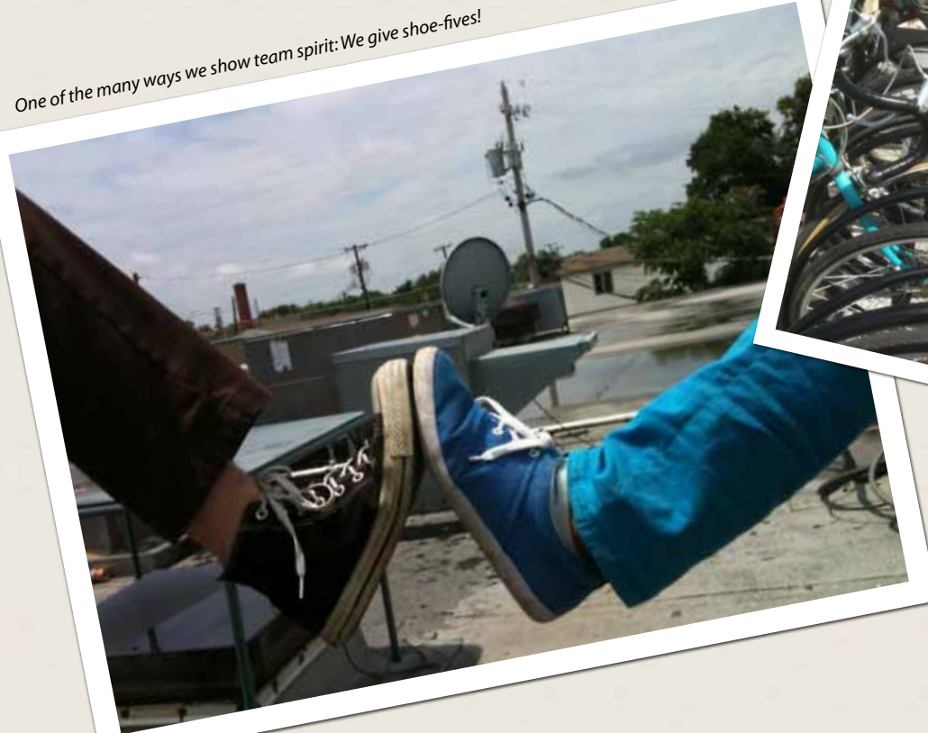
One of the many ways we show team spirit: We give shoe-fives!