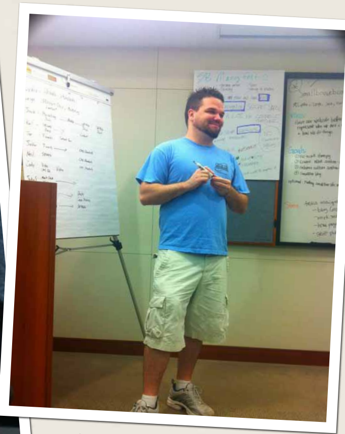
All good things start with a plan.