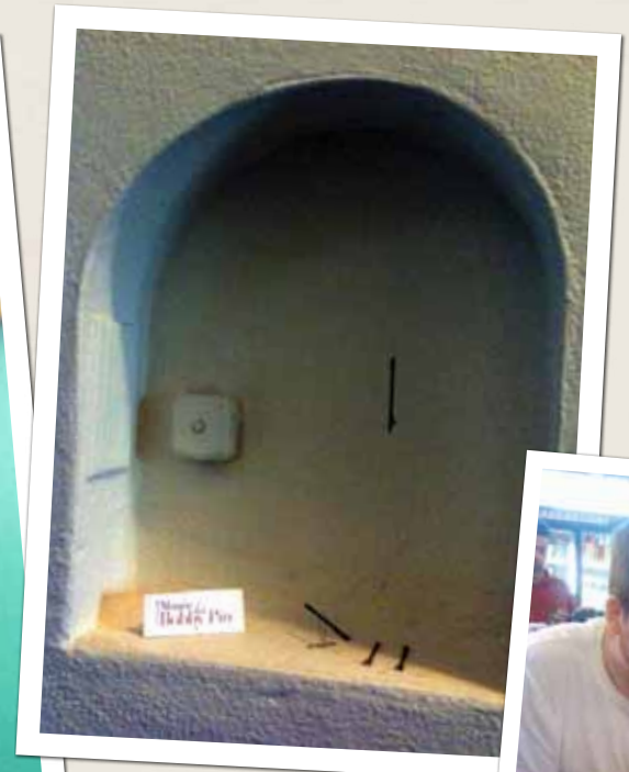
Musée de Bobby Pin